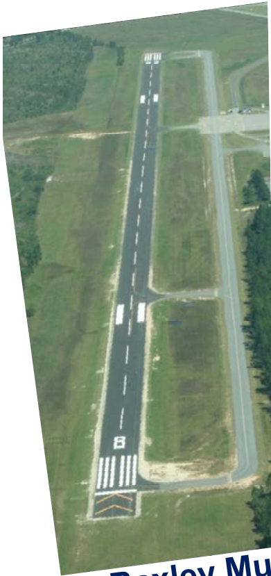
Baxley Municipal Rehabilitate Runway 8/26 $510,000 project cost