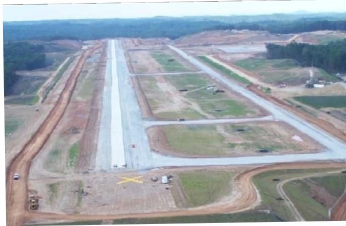
New Paulding Co. Regional Airport Opened November 14, 2008 $21,061,513 FY08 Project Cost