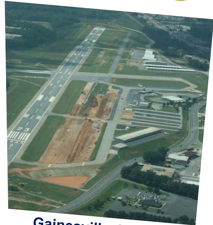
Gainesville-Lee Gilmer Memorial Parallel Taxiway Construction & Lighting $2,239,078 Total project cost