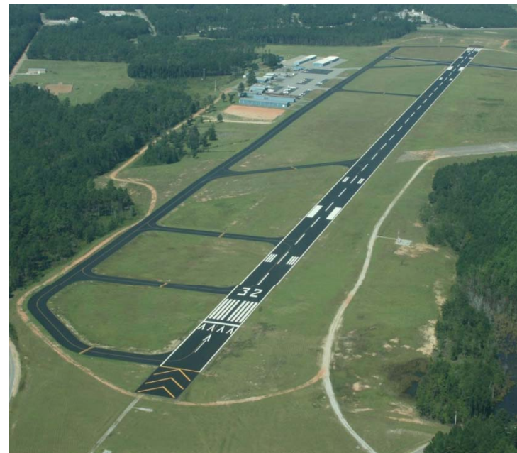
Statesboro-Bulloch Co. Airport